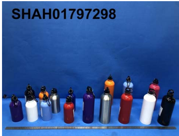
Picture of sample